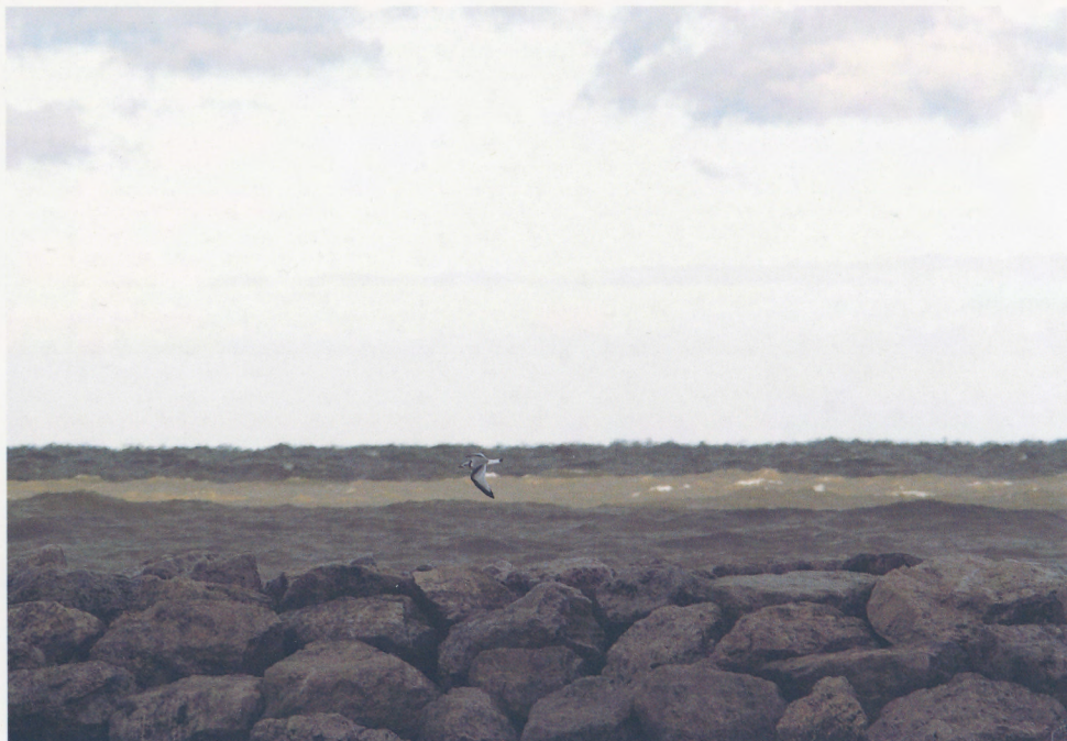
Black-legged Kittiwake 357-01-2005 Presque Isle S.P. Erie Co 12/3/2005